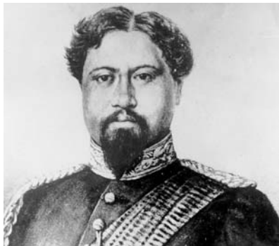
CLOCKWISE FROM TOP: KAMEHAMEHA I, KEKUANAO'A. LOT KAMEHAMEHA, RUTH KE'ELIKOLANI WITH HER SON LELEIOHOKU, BERNICE PAUAAHI, AND WILLIAM PITT KINA'U.