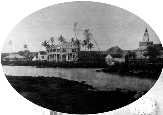
HALE'ŌLELO, KE'ELIKŌLANI'S TRADITIONAL HOME IN KAILUA, KONA; INSET: HULIHE'E PALACE IN THE 1860s, PHOTOGRAPHED FROM THE SEASIDE.

During the Princess's lifetime, large numbers of Hawaiians were converting to Christianity, reflecting in part a traditional Hawaiian response to increasing deaths caused by foreign diseases against which Hawaiians had little or no immunity. As traditional Hawaiian worship of the major deities Kū, Kāne, Lono, and Kanaloa had been officially abolished in 1819, Christianity was now the religious means to attain spiritual and physical harmony that, from a traditional Hawaiian perspective, could restore good health to those who were ill. Despite the pressures from haole missionaries and Hawaiians alike, Ke'elikōlani saw value in traditional ways. Determined to uphold the honor of her ancestors, she retained many traditional religious practices. Although she learned English among other subjects at the missionary-run Chief's Children's School, she was a staunch supporter of the Hawaiian language and traditional cultural practices. She insisted that she be addressed only in Hawaiian, requiring non-Hawaiian speakers to use translators if they wished to communicate with her. And despite owning Hulihe'e, a Western-style house in Kailua, Kona, she chose to live in a large, traditional grass home on the same oceanfront property.